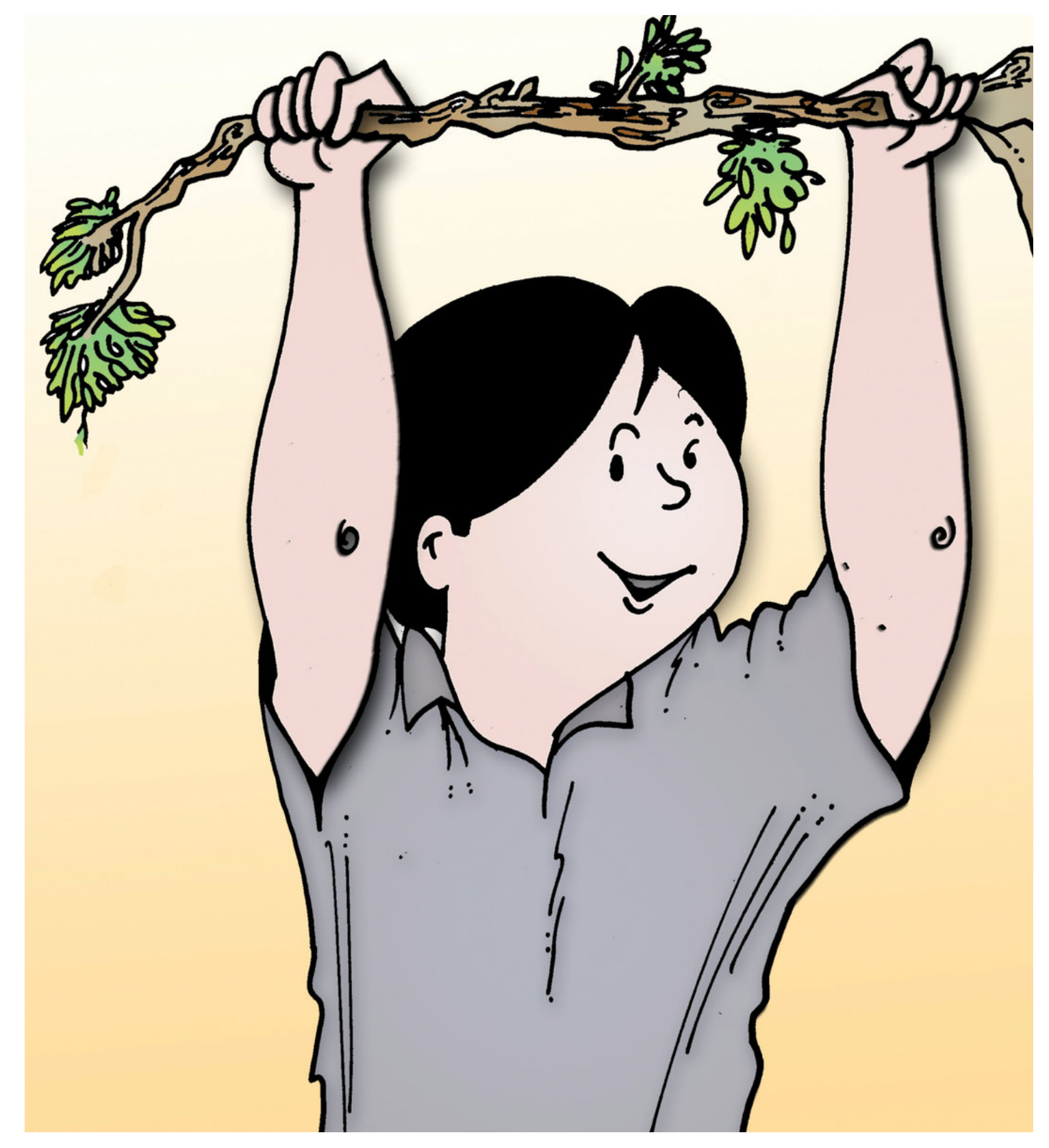
And my arms... such a nice swing!