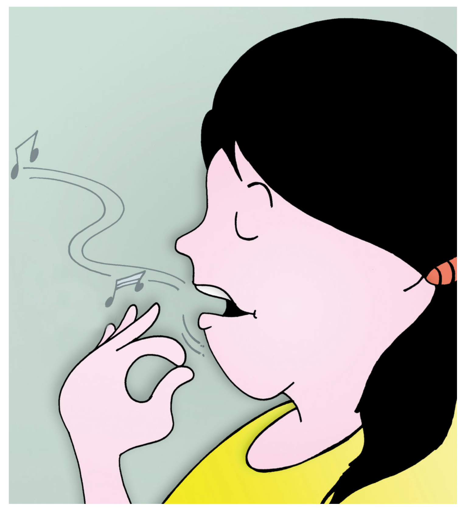
I can sing. Should I sing you a song?