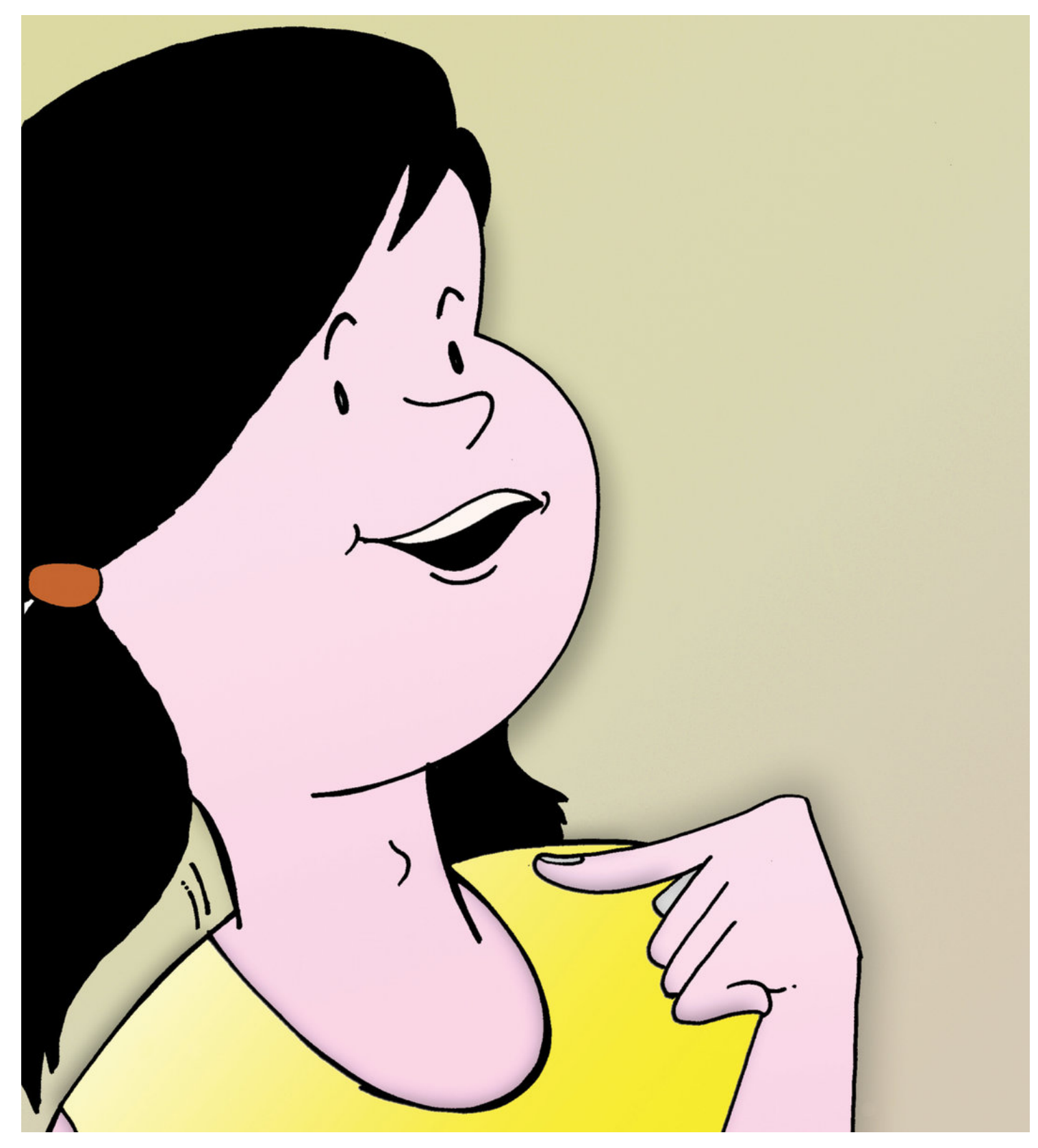
Ma says I have a good voice. Does it come from my throat?