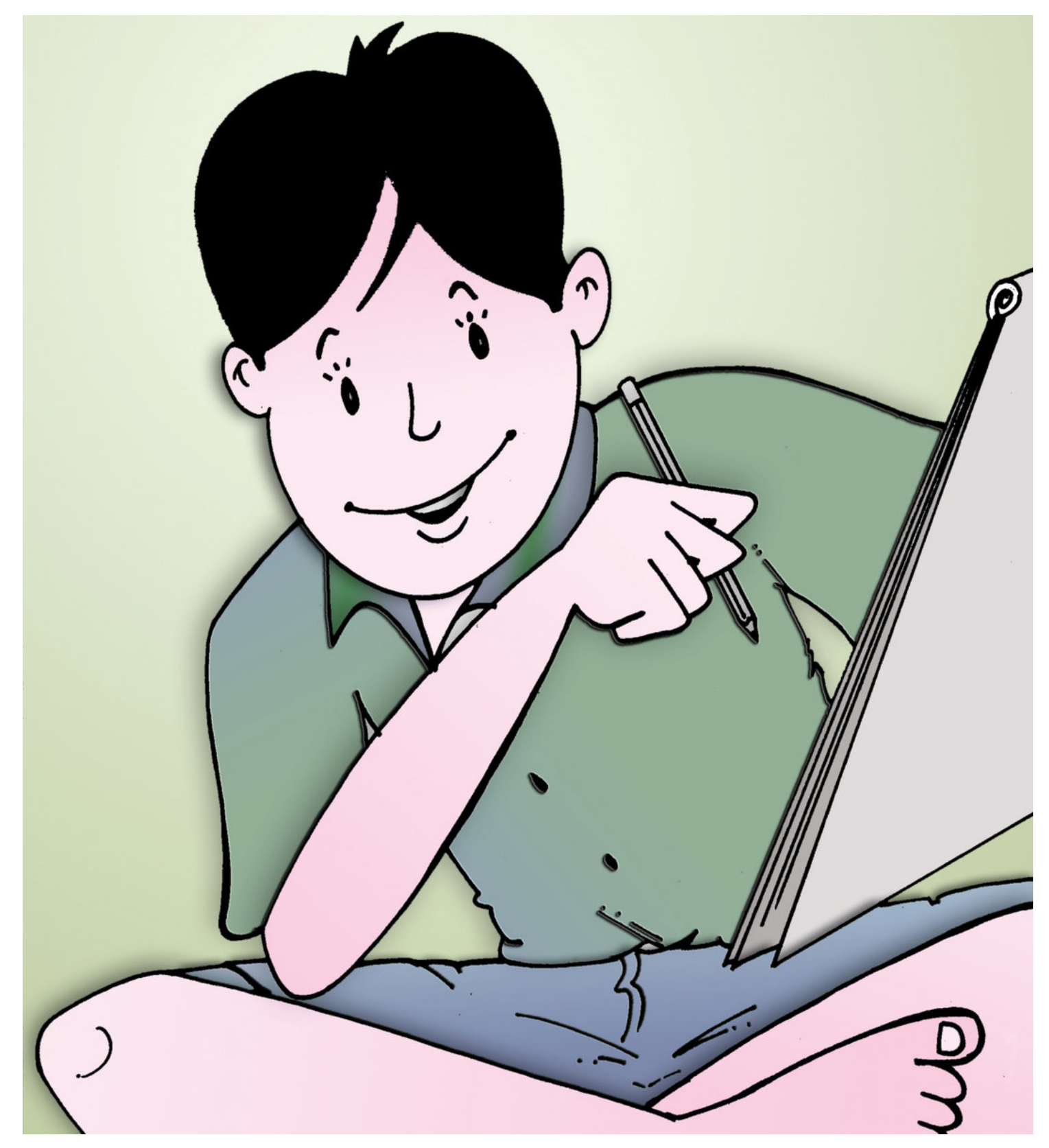
Should I draw your picture? I can see you with my eyes.