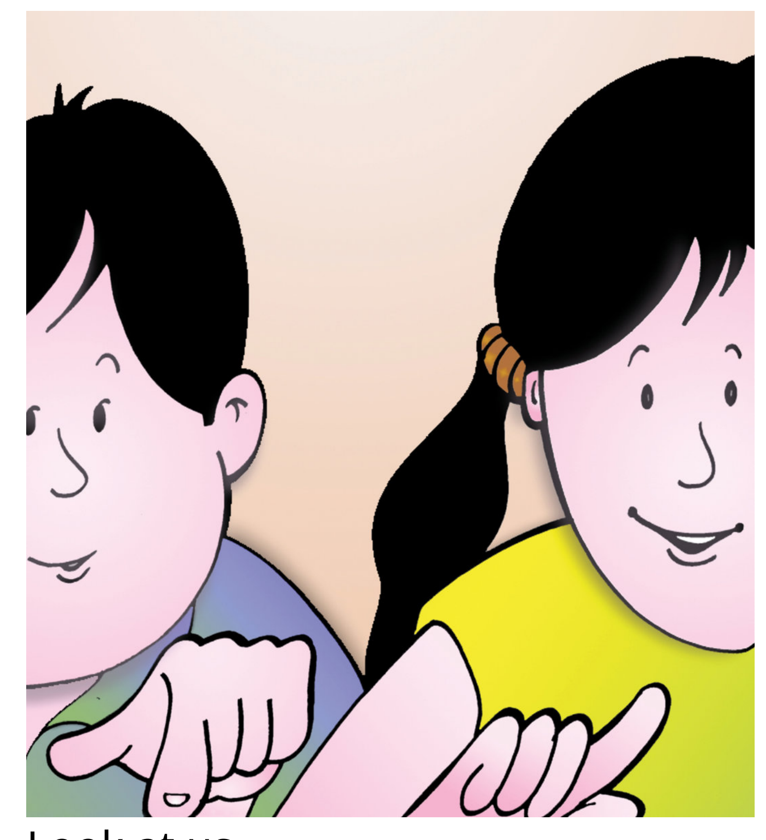
Look at us. Do you want to be our friend?