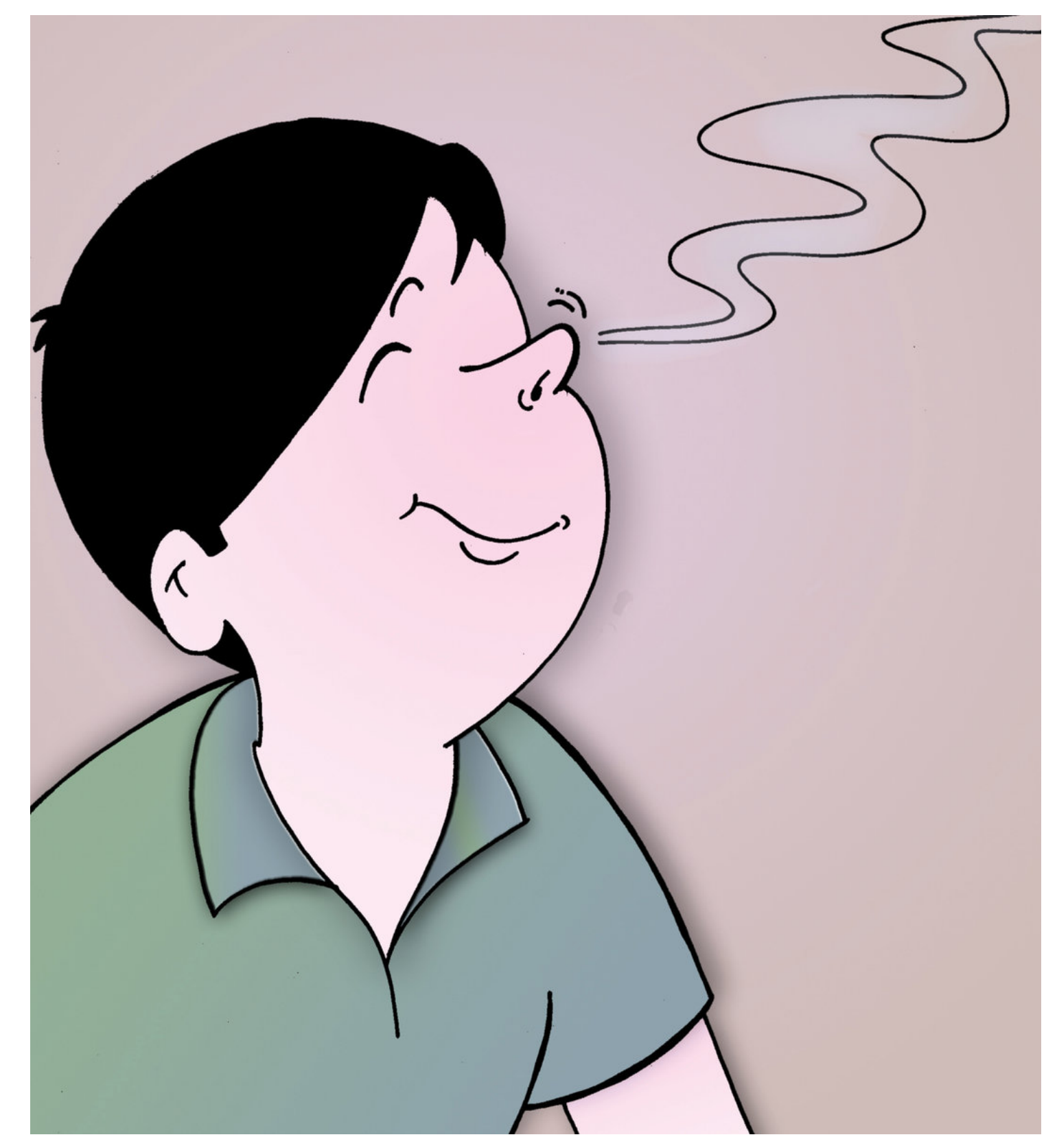
I think Ma is making halwa. I can smell it with my nose.