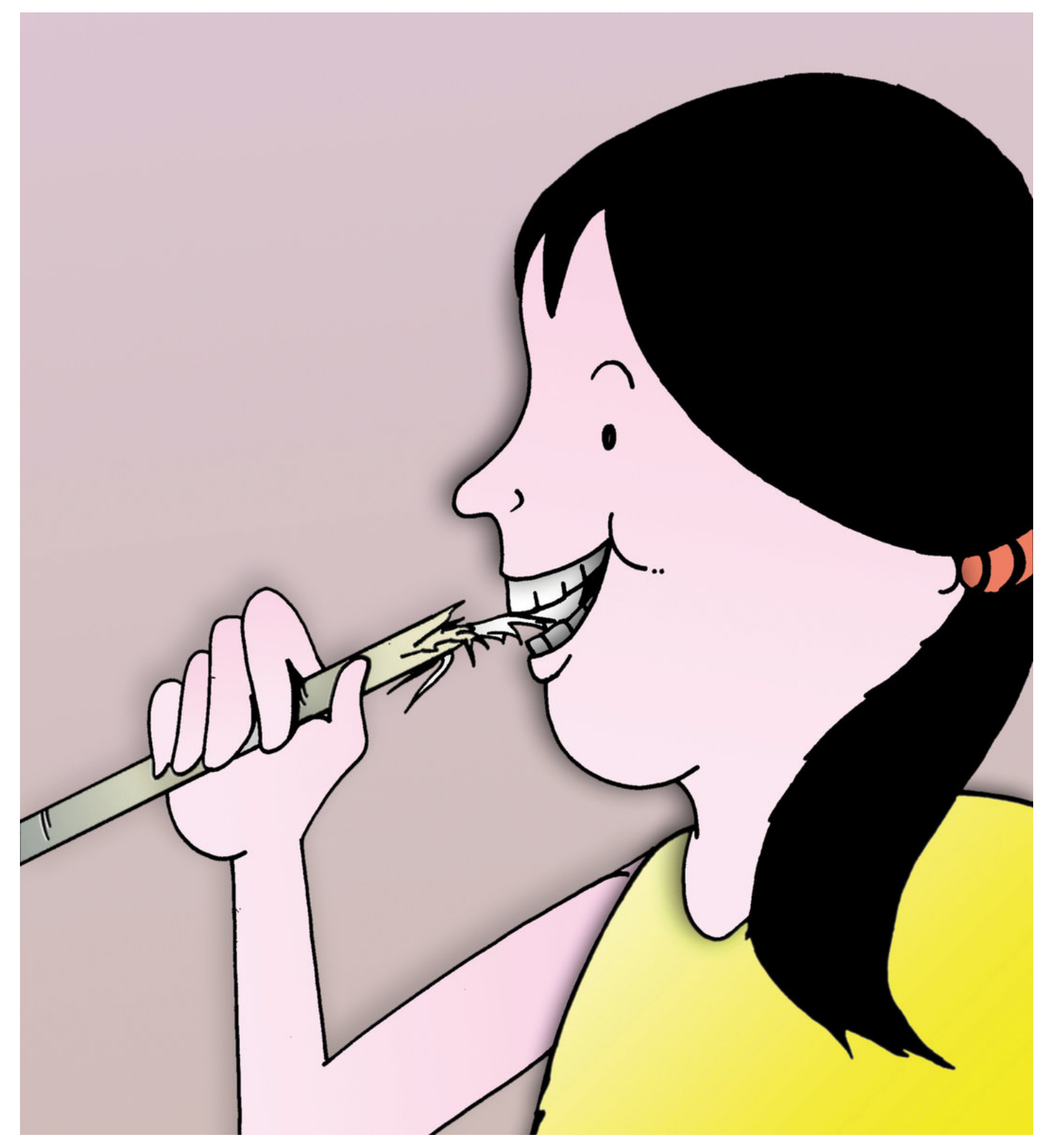
Oh! This sugarcane is so tough! But my teeth are strong too!