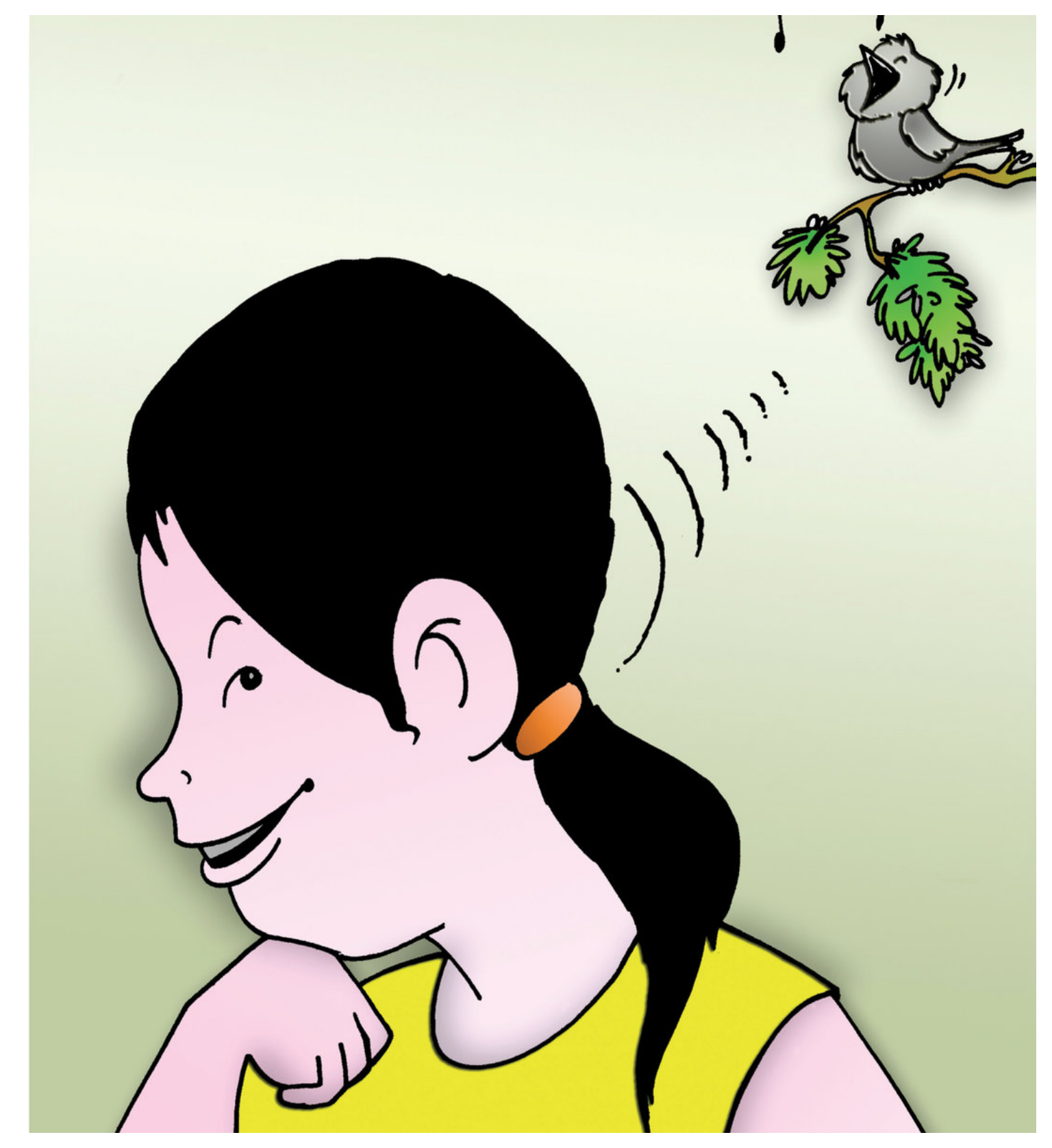
The bird sings a sweet song. I can hear it with my ears.