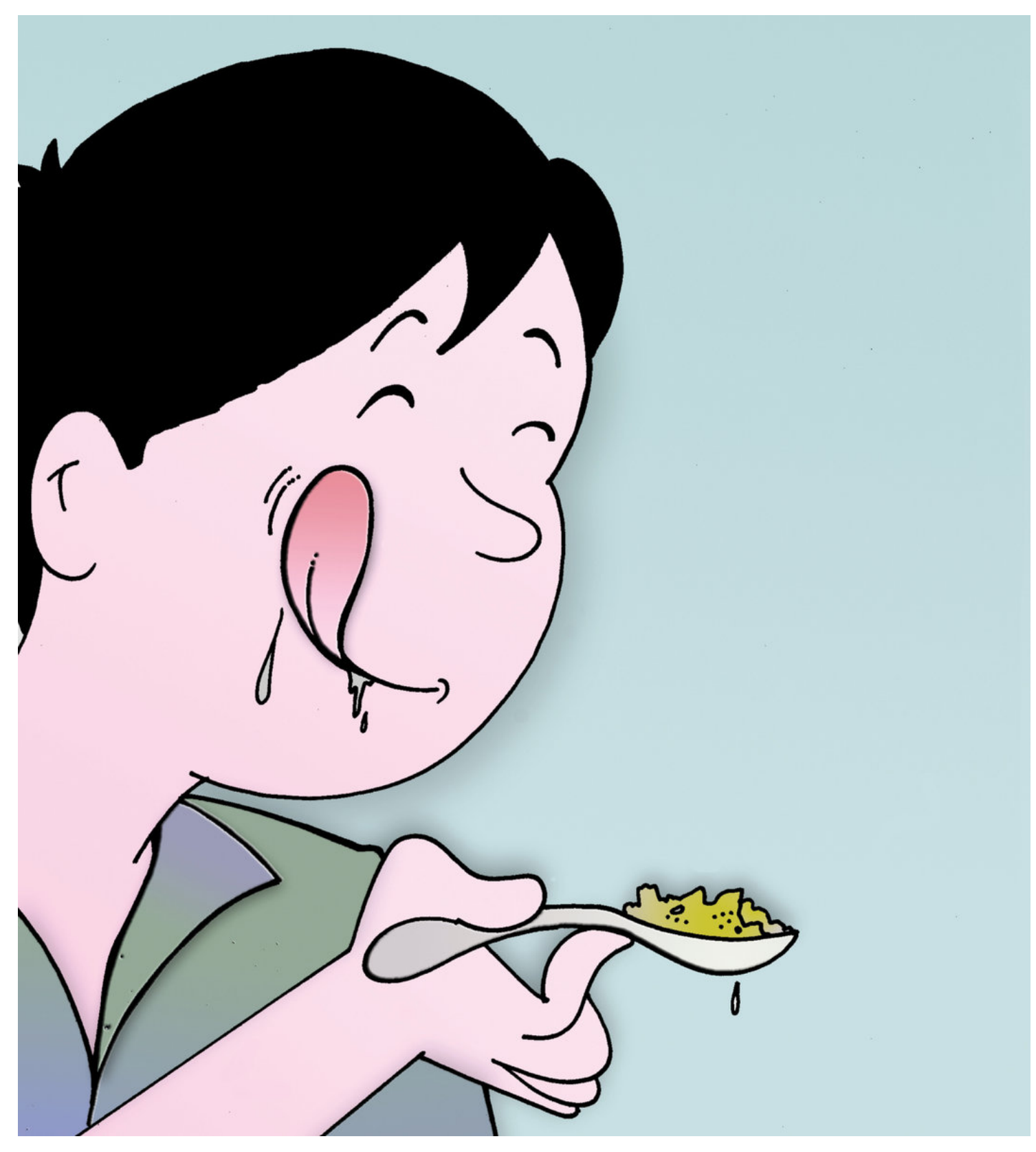
It is very sweet. My tongue just told me.