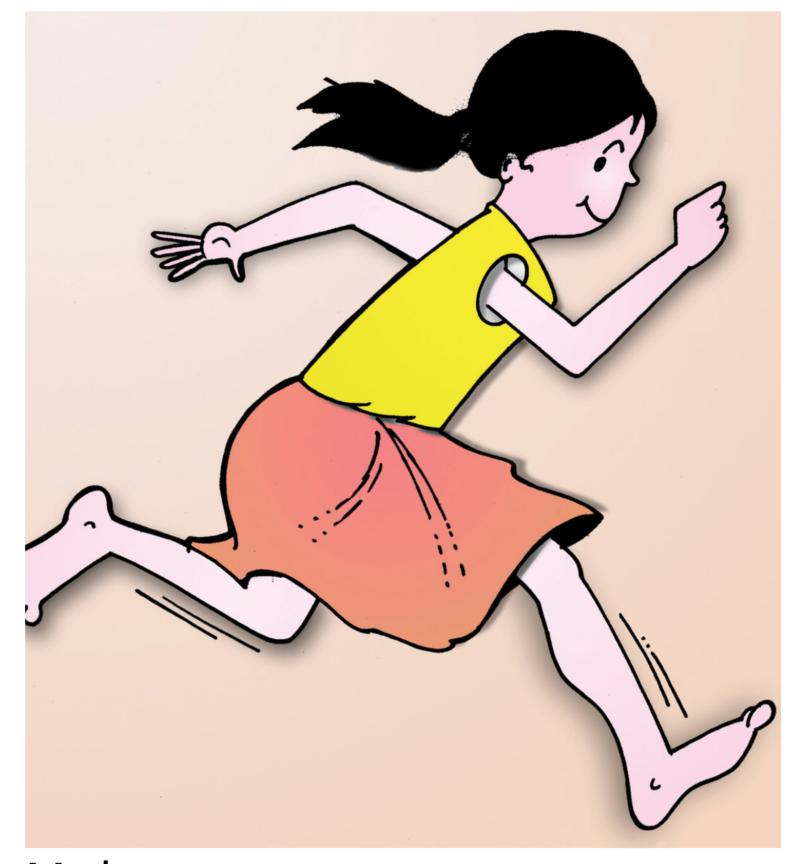
My legs are very strong. I can run really fast with them.